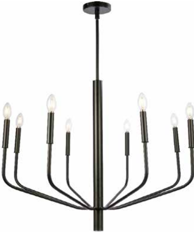
8 Light Incandescent Chandelier, Matte Black